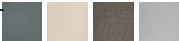
LANDEN 40 Colors SMART MOVE 81 Colors SAINT TROPEZ 48 Colors MONTE CARLO 40 Colors