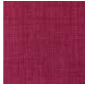
SAINT TROPEZ 48 Colors