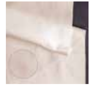
RM DESIGNER SUPER SATEEN Ivory