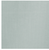
SMART MOVE 81 Colors