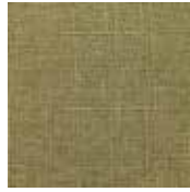
MONTE CARLO 40 Colors