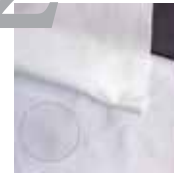
RM DESIGNER SUPER SATEEN White