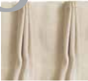
Three Pleat Tacked at Top