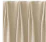
Two Pleat Tacked at Top