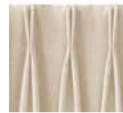
Two Prong Pleat