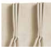
Three Prong Pleat