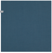
LANDEN 40 Colors

FOUR BEST SELLING FABRICS IN ALL COLORWAYS REPRESENTING 209 SKUS