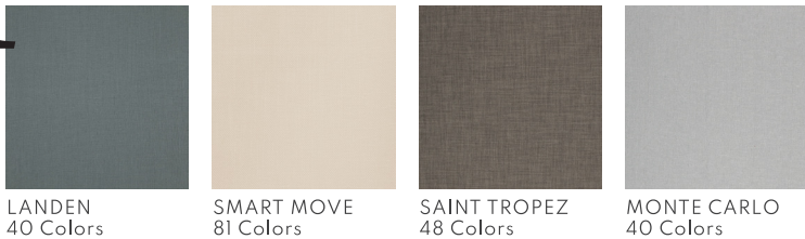
LANDEN 40 Colors | SMART MOVE 81 Colors | SAINT TROPEZ 48 Colors | MONTE CARLO 40 Colors