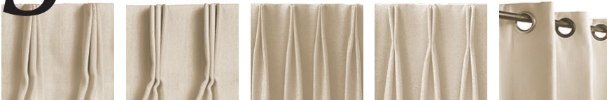
Three Prong Tacked at Top Pleat | Three Prong Pleat | Two Prong Tacked at Top Pleat | Two Prong Pleat | Grommet (additional charge)