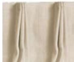
Three Prong Tacked at Top