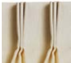
Three Prong Pleat

Panels in shirred style have 1" heading and 1 1/2" pocket