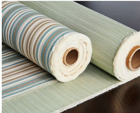
Up the Roll

The top fabric is Up-the-Roll and the bottom fabric is Woven Railroaded